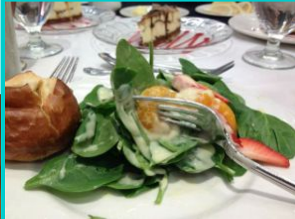
Delicious Salad from Friday's Lunch