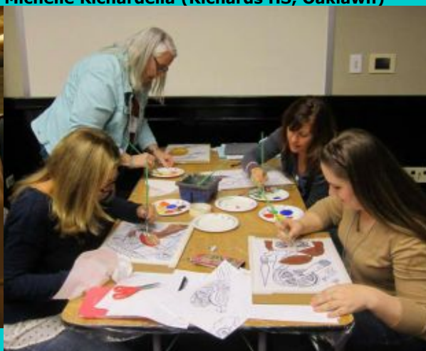
from Friday Afternoon workshop, Stitched Journal