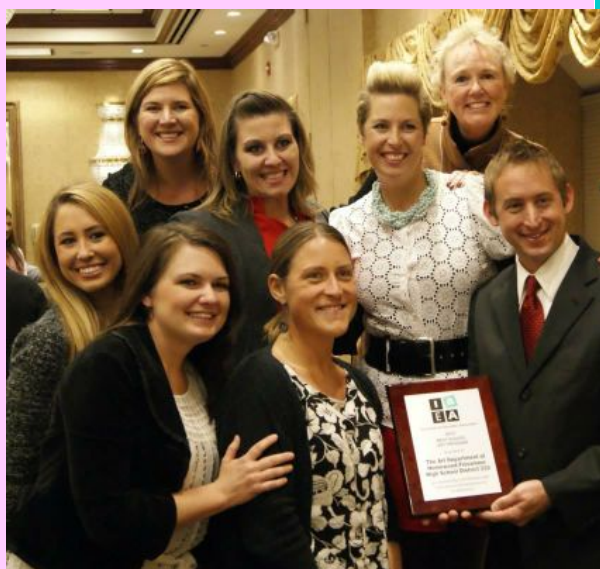
Homewood Flossmoor High School Art Department, Best School Art Program in Illinois