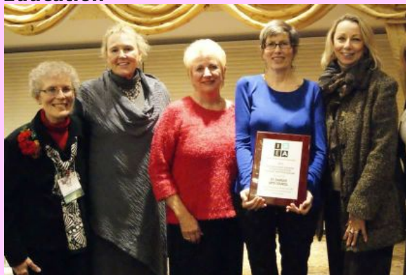
St. Charles Arts Council, Distinguished Service to Art Education from outside the Profession